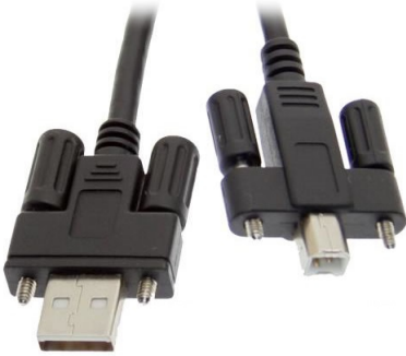
Screw Lock Cable Connectors